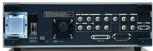
SR810 & SR830 Rear Panel